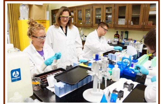
IHC Research Laboratory - Mount Marty College

People can expect a certain amount of gossip in the workplace. The key is to know when the gossip is causing negative aspects to the team dynamics. Gossip disrupts the workplace and the business of work, hurts employee's feelings, damages personal relationships and reputations and injures employee motivation and morale. In the scientific workplace, gossip may be especially risky, because gossip is almost always based on unverified information,